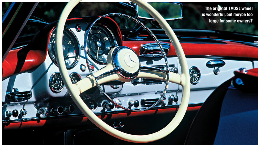
The original 190SL wheel is wonderful, but maybe too large for some owners?

So we now offer smaller diameter replicas for these cars. Since the main reason for replacing the wheel is functionality, there must be no drawbacks such as poor instrument visibility or difficult activation of the column stalk, and the quality must be equal to or better than that of the original. All our steering wheels are produced in the Netherlands to the highest quality standards,