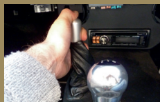
Left: fly-off handbrake can need explaining to Morgan newcomers