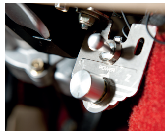
Left: electric motor attaches to a new part in the column. Above: dial allows amount of assistance to be tweaked